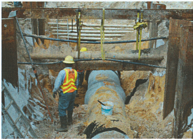
SR-5/PGA Boulevard: Joe Bagford's crew installs drainage while supporting extensive existing utilities