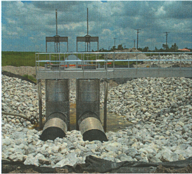
Culvert S-377: 48 inch CAP flashboard risers with weir gates plus catwalk