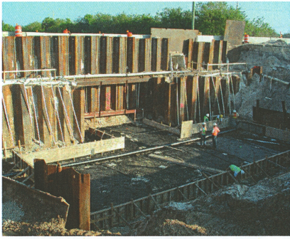
Lakeside Ranch: Excavation and formwork for box culvert beneath county route 15B