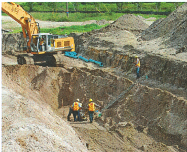
Devonshire Health: Installing 8 inch gravity sanitary sewer pipe 18 feet deep